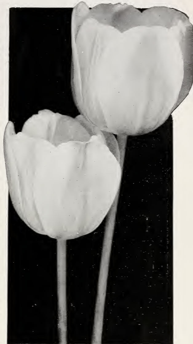
Princess Elizabeth, Psyche.